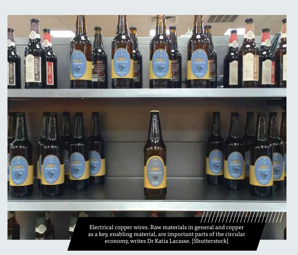
FEVE - The European Container Glass Federation

o prevent littering and foster more recycling, some member states are considering setting mandatory deposit-return schemes (DRS) on single-use beverage packaging. For plastic packaging, there are reasons to believe this could happen: